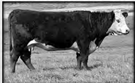
H5 MS 246 DOMET 7200 • First calf heifer • CL1 Domino 246M x JA L1 Domino 9213, CL1 Domino 501 • Proven cowherd genetics ...balanced & functional • Dam, Lot 14 BW 3.3 WW 49 YW 80 MILK 26 M&G 50