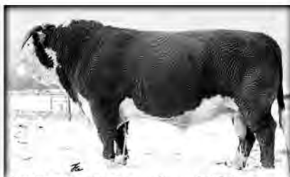
OXH Mark Domino 8020 3/19/1988 (2116 progeny • 802 dgters.)

Foundation Curve Bender, Cowherd Builder!