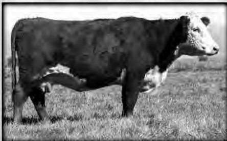
H5 MS 767 ADVANC 231 • Model "Dam of Distinction" • HH Advance 767G x OXH Mark Domino 8020 DOD grndgr. • 6 clvs./WR 114 ...grndgr. #7211 • Gdam, Lot 6 BW 3.4 WW 56 YW 80 MILK 37 M&G 65