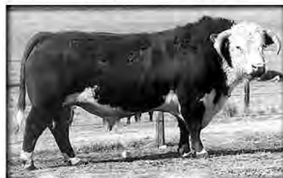
CL 1 Domino 500E 1/16/1995 (353 progeny • 122 dgters.)

Landmark Maternal & Carcass Sire ...Few Compare!