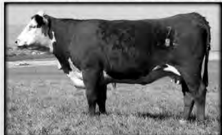
H5 MS 408 DOMET 7186 • Standout Harland 1st calf dgr. ...superb CA Domino 398 dam (10 clvs./WR 104) • 1 calf/WR 102 ...IMF +.32 • Dam, Lot 23 BW 3.6 WW 53 YW 81 MILK 28 M&G 55