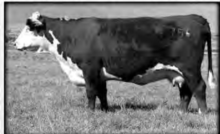
H5 MS 408 DOMET 756 • Real beef cow • Harland first calf heifer ...HH Advance 255M x CL1 Domino 500E dam... #8182 family • Stacked performance & carcass ...IMF +.46 BW 2.9 WW 57 YW 100 MILK 27 M&G 55