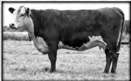
H5 MS 767 ADVANCE 1144 • HH Advance 767G dgr. ...HH Advance 303C dam • 7 clvs./WR 98 ...two dgrs. • Dam, Lots 37, 94 BW 0.5 WW 35 YW 56 MILK 26 M&G 43