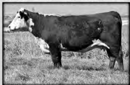
H5 MS 465 DOMET 7283 • Future impact cow • H5 9126 Domino 465 x CL1 Domino 986J (#475) • 1st calf/WR 107... performance, milk, carcass ...REA +.59! BW 4.3 WW 49 YW 90 MILK 32 M&G 56