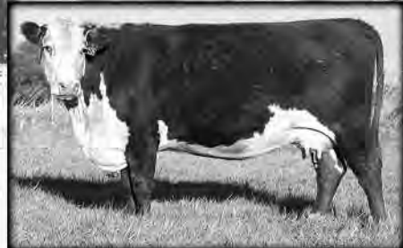
H5 MS 767 ADVANCE 106 • Beautiful matron ...HH Advance 767G x HH Advance 7038G • 6 clvs./WR 101 ...three replacement dgrs. • Dam, Lot 100; Gdam, Lot 31 BW 3.8 WW 48 YW 75 MILK 27 M&G 51