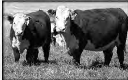
H5 MS 986 DOMET 475 • CL1 Domino 986J dgr. x HH Advance 767G grndgr. • 4 clvs./WR 108 ...two daughters • REA +.45 / 3 hd. REA 110 • Dam, Lots 72, 112 BW 4.1 WW 48 YW 79 MILK 28 M&G 52