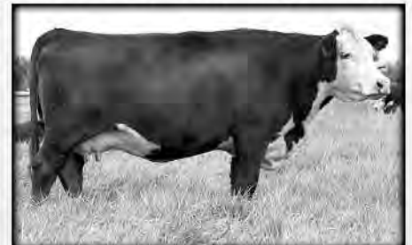
H5 MS 559 DOMET 938 • Elite brood cow • CL1 Domino 559E x CA Domino 338 (CL1 386), HH Advance 9012Y • 9 clvs./WR 106 ...three replacement dgrs. • Gdam, Lot 108 BW 0.9 WW 41 YW 62 MILK 25 M&G 45