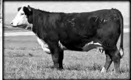
H5 MS 001 DOMET 736 • Model Hereford female • H5 501 Domino 001 dgr. ...HH Advance 255M x HH Advance 767G dam • Grndgr. of DOD #298 • 1 calf/WR 102 ...IMF +.20 BW 2.6 WW 51 YW 77 MILK 25 M&G 51