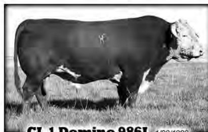
CL 1 Domino 986J 1/20/1999 (383 progeny • 143 dgters.)

All-Around Sire ...Breed Impact Daughters!