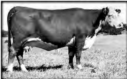
OXH CHRISTI 8185 • Powerful foundation cow • CL1 Domino 5131E x High Volt 80S • 6 clvs./WR 107 ...two dgrs., dgr #1173 • Gdam, Lots 101 & 116 BW 3.6 WW 41 YW 67 MILK 25 M&G 45