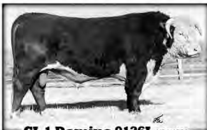
CL 1 Domino 9126J 1/31/1999 (987 progeny • 452 dgters.)

Complete, Total Performance Sire From Calving Ease to Carcass!