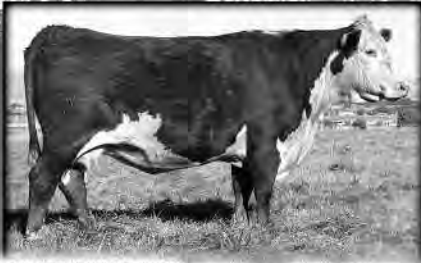
H5 MS 767 ADVANCE 047 • HH Advance 767G x OXH Mark Domino 8020 "Dam of Distinction" #123 • 6 clvs./WR 108... dam, H5 sire H5 255 Advance 6262, herd bulls to Camco, NM, CA Livestock, MO • Dam, Lot 60 BW 1.2 WW 50 YW 71 MILK 35 M&G 60