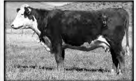
H5 MS 001 DOMET 4193 • Future impact cow! • H5 501 Domino 001 x HH Advnc 767G, OXH 8020 (dam #2124) • 4 clvs./WR 112 ...one dgr., herd bull to Van Newkirk, NE • Dam, Lot 39 BW 1.0 WW 53 YW 73 MILK 33 M&G 60