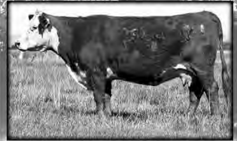
H5 MS 9012 DOMET 710 • Cornerstone mother cow • HH Advance 9012Y x CA Domino 310 • 8 clvs./WR 102 ...three dgrs. • Gdam, Hfr Lot 128 BW 1.3 WW 36 YW 47 MILK 20 M&G 38