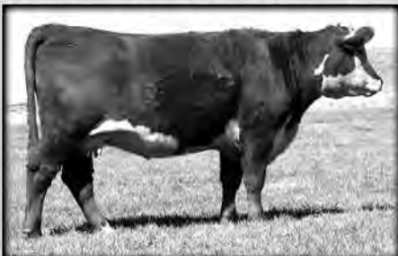
H5 MS 9126 DOMET 601 • Power producer • CL1 Domino 9126J x HH Advance 255M • 2 clvs./WR 105 ...H5 001 Domino 801 to Lee Livestock, NV • Dam, Lot 22 BW 0.4 WW 48 YW 77 MILK 33 M&G 57