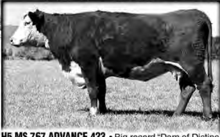
H5 MS 767 ADVANCE 423 • Big record "Dam of Distinction" • HH Advance 767G dgr. • 4 clvs./WR 106 ...one dgr., herd sires H5 408 Domino 881 (Dufur, OK), H5 255 Advance 7110 (Otle, WA) • Dam, Lot 36 BW 1.2 WW 44 YW 68 MILK 35 M&G 57