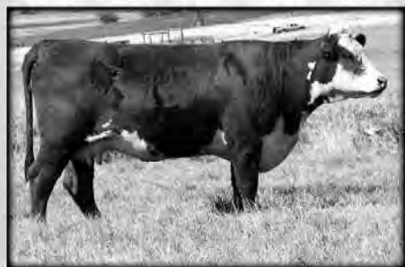
H5 MS 465 DOMET 7280 • H5 9126 Domino 465 1st calf heifer • Three generation "Dam of Distinction" cow family ...Gdam, #9093 • 1 calf/WR 110 ...REA +.59 • Dam, Lot 11 BW 4.9 WW 49 YW 93 MILK 35 M&G 60