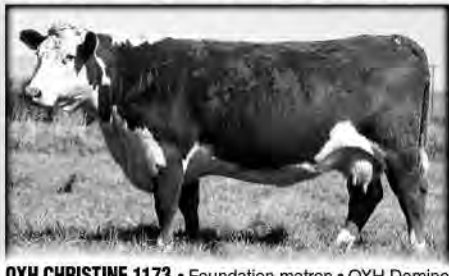
OXH CHRISTINE 1173 • Foundation matron • OXH Advnc 9340 (CL1 5131E) x OXH Mark Domino 8020 ...two generation DOD cow family • 6 clvs./WR 107 ...two dgrs., #785 • Gdam, Lots 17, 28 and Heifer Lot 154 BW 4.6 WW 38 YW 77 MILK 33 M&G 51