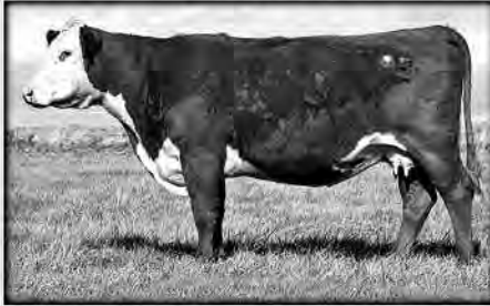
H5 MS 9012 DOMET 958 • Herd impact "Dam of Distinction" • HH Advance 9012Y x OXH Mark Domino 8020 • 9 clvs./WR 106 ...7 replacement dgrs. • Dam, Lot 63; Heifer Lot 125 BW 5.6 WW 50 YW 80 MILK 23 M&G 48