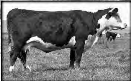
H5 MS 853 DOMET 0212 • "Dam of Distinction" beef cow • CL1 Domino 853H x F Spectrum 201 • 8 clvs./WR 103 ...four dgrs., grndgr. #424 • Dam, Lot 32; Gdam Lots 15, 16, 54, Hfr Lot 150 BW 5.0 WW 44 YW 75 MILK 18 M&G 40