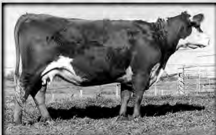
OXH TONI 0130 • Landmark "Dam of Distinction" ...former Oxley donor • OXH Andrew 8111 x SR Mark I J215 • 12 clvs./WR 111 • Producer of herd bulls, great dgrs. • Gdam, Lot 117 BW 2.8 WW 21 YW 31 MILK 29 M&G 39