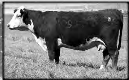
H5 MS 001 DOMET 702 • H5 501 Domino 001 x CL1 Domino 246M first calf heifer ...Gdam, #974 • 1 calf/WR 103 • Dam, Lot 5 BW 2.0 WW 44 YW 62 MILK 28 M&G 50