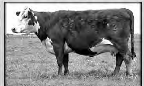
H5 MS 7038 DOM 9182 • Top "Dam of Distinction" • HH Advance 7038G x elite OXH Mark Domino 8020 "DOD" • 7 clvs./WR 105...two replacements • Dam, Lot 109; Gdam, Lot 45, Heifer Lot 152 BW 8.6 WW 52 YW 91 MILK 20 M&G 47