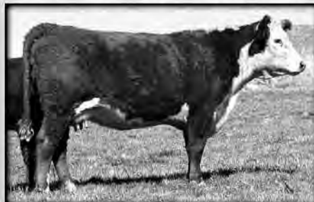
H5 MS 246 DOMET 624 • Standout young cow • CL1 Domino 246M x OXH Domino 1395, OXH 8020 ...DOD cow line • 2 clvs./WR 111 ...H5 herd bull H5 001 Domino 806 • Dam, Lot 33 BW 3.8 WW 42 YW 71 MILK 33 M&G 54