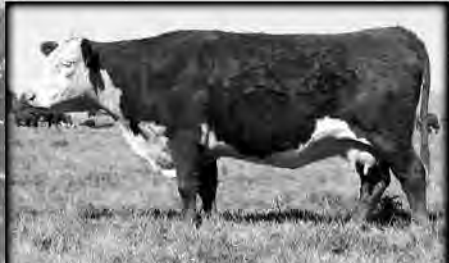
H5 MS 767 ADVANCE 036 • HH Advance 767G dgr. ...CL1 Domino 590 x Star Donald 335F "Dam of Distinction" mother • 8 clvs./WR 102...two top dgrs. • Gdam, Lots 64, 90 BW 0.2 WW 38 YW 53 MILK 29 M&G 48