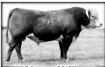
HH Advance 9012Y 2/20/1989 (1744 progeny • 709 dgters.)

Hi-Maternal Daughters ...Breed Leading Calving Ease!