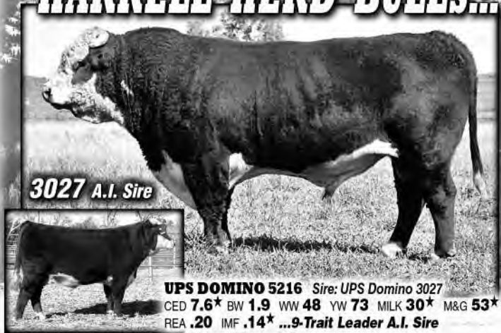
UPS DOMINO 5216 Sire: UPS Domino 3027 CED 7.6 * BW 1.9 WW 48 YW 73 MILK 30 * M&G 53 * REA .20 IMF .14 * ...9-Trait Leader A.I. Sire

Powerful, Calving Ease, Hi-Maternal Beef Bull!