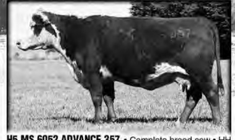
H5 MS 6052 ADVANCE 357 • Complete brood cow • HH Advance 6052F x OXH Mark Domino 8020 • 5 clvs./WR 103 ...dam, Perez (NM) & Fuston (TX) sire H5 9126 Domino 752 • Dam, Lot 34 BW 1.1 WW 39 YW 63 MILK 20 M&G 40