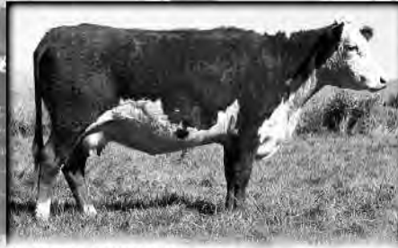
H5 MS 767 ADVAN 2124 • HH Advance 767G x OXH Mark Domino 8020 • 3 clvs./WR 113 ...replacement dgr. #4193 • Gdam, Lot 39 BW 2.5 WW 47 YW 71 MILK 32 M&G 56