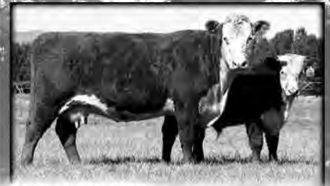
H5 MS 552 DOMET 309 • Top CJH L1 Domino 552 "Dam of Distinction" • 5 clvs./WR 104 ...one dgr., herd bulls to Sonoma Mtn., CA, Big Gully, CAN • Dam, Lot 68 BW 3.1 WW 53 YW 82 MILK 22 M&G 48