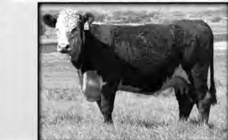
H5 MS 408 DOMET 7211 • Harland 1st calf dgr. ...HH Advance 255M x HH Advance 767G dam • Gdam, #231 • 1 calf/WR 109 ...REA +.44/IMF +.21 • Dam, Lot 6 BW 3.8 WW 58 YW 96 MILK 32 M&G 60