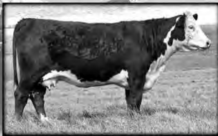
H5 MS 246 DOMET 708 • Model 1st calf hfr • CL1 Domino 246M x HH Adv 255M, CL1 500E, OXH 8020 • REA +.38 /IMF +.36 • Generations of trait balanced, herd builder genetics! BW 0.5 WW 46 YW 72 MILK 23 M&G 46