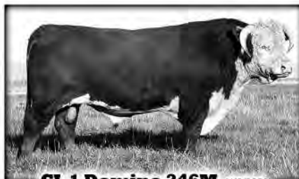
CL 1 Domino 246M 1/10/2002 (330 progeny • 95 dgters.)

CED BW WW YW MM M&G 8.3* -0.1* 44.79 75.80 32* 54* Carcass (237 hd): BF -.00 .59 REA .12 .59 IMF -.03 .57 5-Trait Leader ...CED • BW • MILK • M&G • CEZ