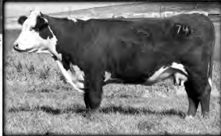
H5 MS 465 DOMET 746 • Performance stacked 1st calf heifer • H5 9126 Domino 465 x HH Advance 7038G • Gdam, #915 cow • 1 calf/WR 114 ...REA +.32 • Dam, Lot 3 BW 3.7 WW 44 YW 80 MILK 33 M&G 55