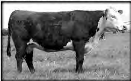
H5 MS 501 DOMET 157 • CL1 Domino 501 x CL1 Domino 500E, OXH Mark Domino 8020 ...landmark #123 cow family • 6 clvs./WR 100 ...two dgrs. • Dam, Lot 103, Heifer Lot 129 BW 3.0 WW 37 YW 51 MILK 24 M&G 42