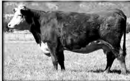
H5 MS 9126 DOMET 5168 • CL1 Domino 9126J dgr. ...dam, OXH Mark Domino 8020 "Dam of Distinction" #734 • 3 clvs./WR 104 ...REA +.48 • Dam, Lot 29 BW 2.0 WW 49 YW 74 MILK 36 M&G 60