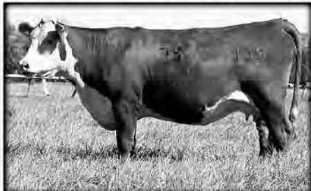
H5 MS 7159 DOMET 135 • "Dam of Distinction" "milk cow" • CL1 Domino 7159G x CL1 Domino 559E dgr. #915 • 6 clvs./WR 105 • Gdam, Lot 7 BW 3.4 WW 56 YW 83 MILK 30 M&G 58