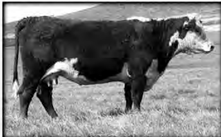
H5 MS 9126 DOMET 7121 • Young "super" cow • CL1 Domino 9126J x HH Advance 255M, HH Advance 9012Y ...powerful family • 1 calf/WR 115...REA +.45 • Dam, Lot 4 BW 2.7 WW 57 YW 93 MILK 37 M&G 65