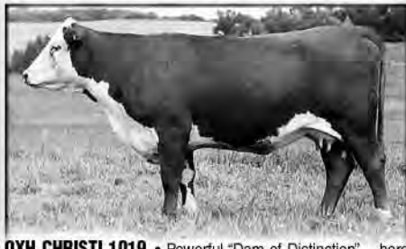
OXH CHRISTI 1019 • Powerful "Dam of Distinction" ...herd bull producer • CL1 Domino 5131E x Starfire • 7 clvs./WR 108 ... REA +.47 • Dam, H5 sire H5 8020 Domino 5210; Reynolds (MO) OXH Mark Domino 3043 BW 5.2 WW 56 YW 102 MILK 24 M&G 52