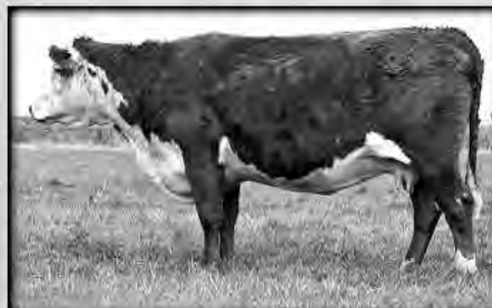
H5 MS 7038 ADVANCE 0148 • "Dam of Distinction" • HH Advance 7038G x HH Advance 303C, HH 9012Y ...top DOD cow line • 6 clvs./WR 99 ...3 dgrs. • Gdam, Lot 122 BW 5.4 WW 44 YW 72 MILK 16 M&G 37