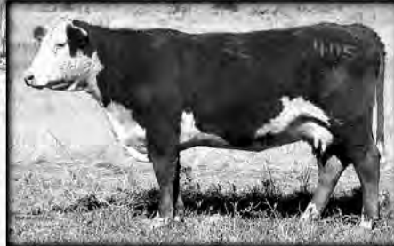
H5 MS 255 ADVANCE 405 • "Dam of Distinction" super cow • HH Advance 255M x CL1 Domino 500E • REA +.73 / 3 hd. REA 123 • 4 clvs./WR 113 • Dam, Lot 48 BW 3.1 WW 55 YW 89 MILK 22 M&G 49