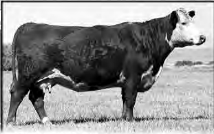
H5 MS 767 ADVAN 298 • Superb "Dam of Distinction"... an ET Donor • HH Advance 767G dgr. • 6 clvs./WR 107 ...dam, H5 herd sire H5 255 Advance 7170, three dgrs. • Dam, Lot 9 BW 1.8 WW 50 YW 76 MILK 32 M&G 57