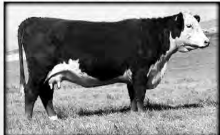
H5 MS 255 ADVANCE 785 • Powerful 1st calf heifer • HH Advance 255M x OXH Domino 9340, OXH 8020 • Dam, OXH 1173 ...DOD cow line • 1 calf/WR 103 • Dam, Lot 17 BW 6.3 WW 52 YW 94 MILK 26 M&G 52