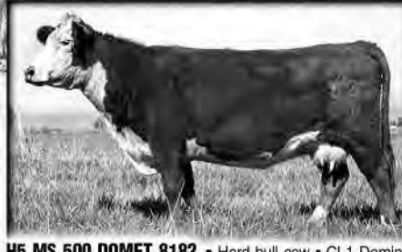
H5 MS 500 DOMET 8182 • Herd bull cow • CL1 Domino 500E x LS Young Donald 45K "Dam of Distinction" mother • 9 clvs./WR 109 • REA .41 • Dam, herdsires H5 501 Dom 001 & H5 408 Dom 8252; Gdam, Lot 21 BW 3.3 WW 44 YW 65 MILK 27 M&G 49