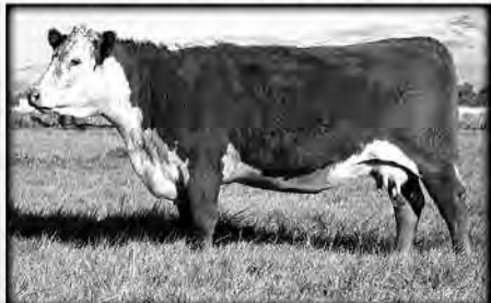
H5 MS 767 ADVANCE 142 • Herd bull mother • HH Advnc 767G x OXH Mark Domino 8020 ...DOD cow line • 7 clvs./WR 100 ...four dgrs. • Dam, herd sire H5 552 Domino 308 BW 3.7 WW 48 YW 80 MILK 29 M&G 53