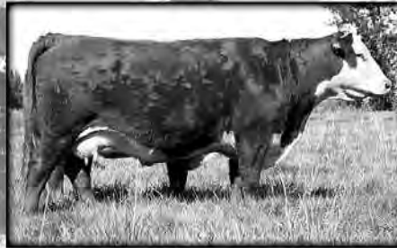
H5 MS 8020 DOMET 734 • Powerful "Dam of Distinction"... OXH Mark Domino 8020 x HH Advance 9012Y • 10 clvs./WR 109...7 replacements • Dam, Lot 88; Gdam Lots 8, 29, 40, 84 BW 4.9 WW 48 YW 71 MILK 24 M&G 48

An American Hereford Top 10 "Dams of Distinction" Herd ...#1 in Oregon!