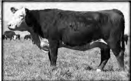
H5 MS 7159 DOMET 114 • Role model producer • CL1 Domino 7159G x CL1 Domino 500E • 7 clvs./WR 102 ...sons to Camco, NM, Forsea & Hill, OR • Dam, Lot 120 BW 0.2 WW 46 YW 56 MILK 21 M&G 44