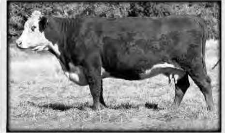
OXH CHRISTI 9093 • "Dam of Distinction" franchise cow • CL1 Domino 5131E dgr. ...L1 x Mark Donald DOD dam • 8 clvs./WR 106 ...grndgr. #7280 • Gdam, Lot 11 BW 2.9 WW 45 YW 74 MILK 24 M&G 47