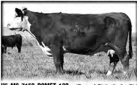
H5 MS 7159 DOMET 132 • "Dam of Distinction" • CL1 Domino 7159G x CL1 Domino 559E, OXH 8020 • 6 clvs./WR 106 ...dam, herd sires H5 255 Advance 6241, Baumgarten's (ND) H5 408 Domino 776 • Gdam, Heifer Lot 131 BW 2.9 WW 47 YW 72 MILK 30 M&G 53