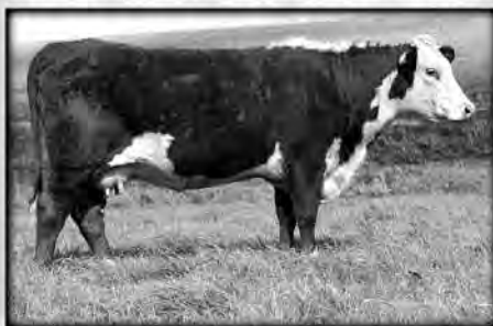
H5 MS 349 ADVANCE 7281 • Stalwart 1st calf mother • H5 767 Advance 349 x CL1 Domino 853H, HH Advance 767G ...Gdam, DOD #097 • 1 calf/WR 107...REA +.42 • Dam, Lot 49 BW 4.8 WW 55 YW 92 MILK 34 M&G 61