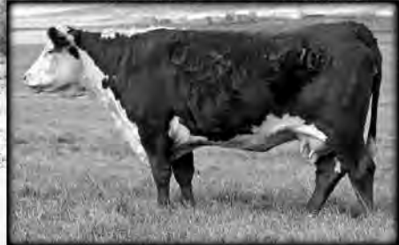
H5 MS 246 DOMET 707 • First calf heifer • CL1 Domino 246M dgr. ...Game Plan, CL1 Domino 500E dam • Dam, Heifer Lot 147 BW -1.5 WW 42 YW 68 MILK 25 M&G 46