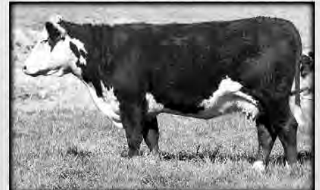
H5 MS 986 DOMET 4199 • Real brood cow • CL1 Domino 986J x CL1 Domino 500E • 3 clvs./WR 106, one herd replacement • REA +.41 • Dam, Lot 69 BW 3.0 WW 43 YW 66 MILK 25 M&G 46