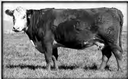
H5 MS 986 DOMET 288 • CL1 Domino 986J x HH Advance 9012Y • "Dam of Distinction" cow line • 5 clvs./WR 100 ...two replacements • Dam, Heifer Lot 153; Gdam, Lot 66 BW 1.3 WW 33 YW 58 MILK 26 M&G 43