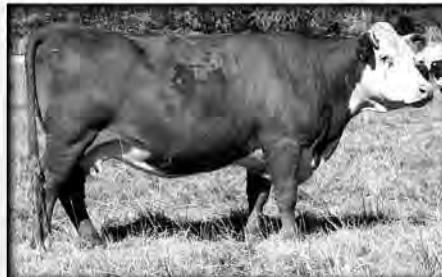
H5 MS 559 DOMET 915 • Herd builder • CL1 Domino 559E x CA Domino 338 (CL1 386) • 6 clvs./WR 107 ...three dgrs., dgr. #135, grndgr. #746 • Gdam, Lots 3, 7, 18, 38, 86 BW 2.5 WW 47 YW 77 MILK 26 M&G 50