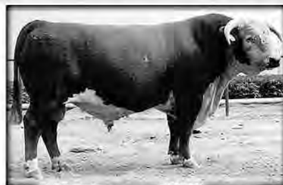
HH Advance 267G 1/19/1997 (1698 progeny • 546 dgters.)

"SUMMER ROUNDUP" ...Baker City, OR Harrell - Thomas Customer Appreciation Day Friday, July 16, 2010 Hosted by Harrell Hereford Ranch During Elks Miners' Jubilee Bronc Riding Blowout Join us for an afternoon of education and ideas about Northwest Premium Genetic Partnership and an evening of great bronc riding competition!