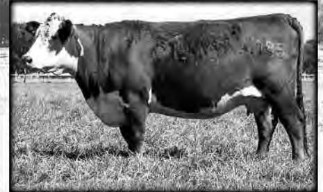
H5 MS 516 DOMET 885 • Landmark "Dam of Distinction" • Elite H5 9012Y Advance 516 dgr. • 8 clvs./WR 107 ...four dgrs. • Dam, herd bull H5 9126 Domino 465, Lots 106 & 107 BW 3.2 WW 37 YW 67 MILK 29 M&G 47