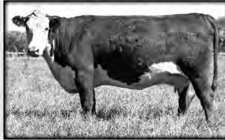
H5 MS 7038 ADVAN 974 • HH Advance 7038G x HH Advance 303C, 114 Domino • 8 clvs./WR 100 ...three herd replacements, grmdgr. #702 • Dam, Lot 70; Gdam, Lots 5, 59 BW 7.3 WW 41 YW 65 MILK 20 M&G 40