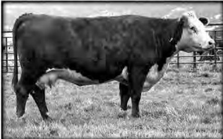
H5 MS 767 ADVANCE 424 • HH Advance 767G x CL1 Domino 7159G • Top cow line ...gdam is #0212 • 3 clvs./WR 104 ...IMF +.21 / 2 hd. IMF 118 • Dam, Lot 54 BW -0.4 WW 47 YW 67 MILK 33 M&G 57