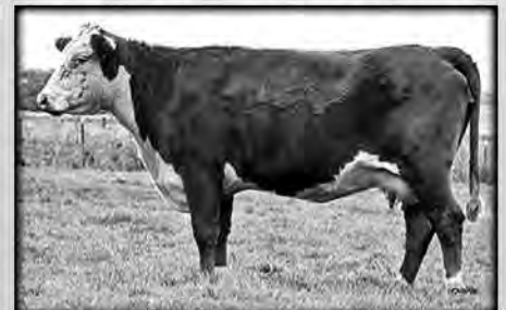
H5 MS 0125 MARKET DOMINO 673 • OXH Mark Domino 0125 x CL1 Domino 986J, OXH 8020 ...734 cow family • Linebred SR Mark I J215 • 2 clvs./WR 110 • REA +.43, IMF +.20 • Dam, Lot 8 BW 4.4 WW 49 YW 79 MILK 34 M&G 58