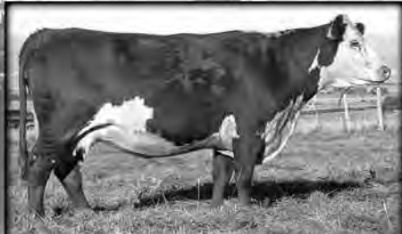
H5 MS 767 ADVANCE 097 • Role model "Dam of Distinction" • HH Advance 767G dgr. • 8 clvs./WR 104 ...grndgr. #7281 • Granddam, Lots 49, 57; Heifer Lot 124 BW 1.8 WW 44 YW 65 MILK 29 M&G 51