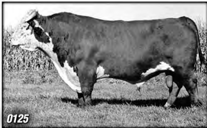
OXH MARK DOMINO 0125 Apr. 4, 2000 • #42075700

The Hereford Curve Bender ...a 10-Trait Leader!