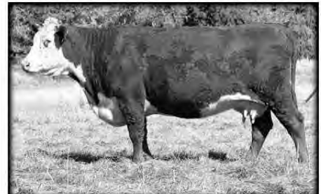
OXH CHRISTI 9093 • "Dam of Distinction" • CL1 Domino 5131E "franchise cow" ...elite L1 x Mark Donald DOD mother • 7 clvs./WR 106 ...one dgtr. • Dam, Hfr Lot 103; Gdam, Lot 89 BW 3.6 WW 46 YW 81 MILK 23 M&G 47