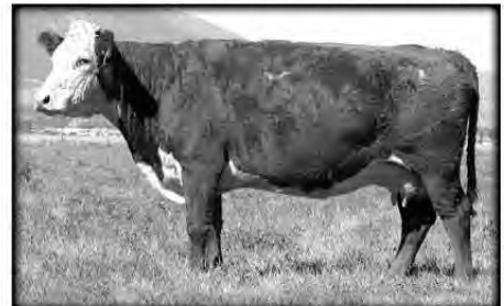
H5 MS 1024 DOMET 781 • Herd bull mother • CL1 Domino 1024 x HH Advance 9012Y, LS Young Donald 45K • 7 clvs./WR 110 • Dam, Harrell sire H5 986 Domino 4229 BW 2.7 WW 37 YW 57 MILK 30 M&G 48