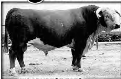
HH ADVANCE 767G 1/19/1997 (1535 progeny • 457 dgters.)

CED ★ 9.8 70 BW ★ -1.4 92 WW 44 89 YW 70 90 MM ★ 40 82 M&G ★ 62 Carcass (430 hd): BF .017 84 REA -.13 84 IMF ★.14 83 9-Trait Leader ...CED • BW • Milk • M&G • CEM IMF • BMI • CEZ • CHB