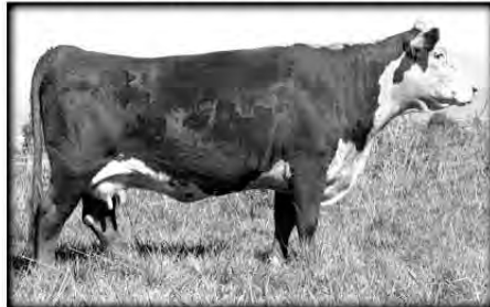
H5 MS 669 ADVAN 930 • HH Advance 669E dght. ...HH Advance 9012Y "Dam of Distinction" mother • 6 clvs./WR 100 ...two herd replacements • Dam, Lot 92