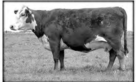
H5 MS 7038 DOM 9182 • Headline "Dam of Distinction" • HH Advance 7038 x elite OXH Mark Domino 8020 DOD dght. • 6 clvs./WR 106 ...three top herd replacements