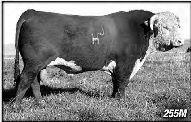
HH ADVANCE 255M 1ET Jan. 7, 2002 • #42281411