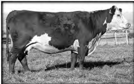
H5 MS 767 ADVANCE 097 • Role model "Dam of Distinction" • HH Advance 767G x CA Domino 417, Lone Star Domino 75B • 6 clvs./WR 107 ...four replacement daughters