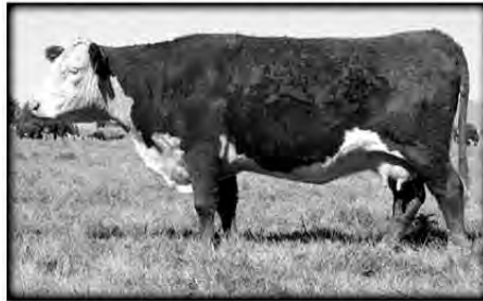
H5 MS 767 ADVANCE 036 • HH Advance 767G dght. ...CL1 Domino 590 x Star Donald 335F "Dam of Distinction" mother • 6 clvs./WR 103...two top dghts. • Dam, Lot 67; Gdam, Lot 72