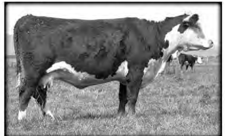
H5 853 DOMET 0212 • "Dam of Distinction" maternal beef cow • CL1 Domino 853H x Spectrum 201 • 6 clvs./WR 106 ...three top herd replacements • Gdam, Lot 7