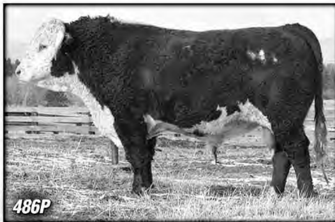
CL 1 DOMINO 486P Jan. 14, 2004 • #42482440

Calving Ease + Maternal ...Total Trait Balance!