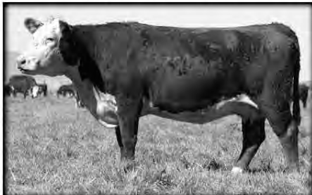
H5 MS 7159 DOMET 114 • "Never-miss, top producer" • CL1 Domino 7159G x CL1 Domino 500E • 5 clvs./WR 105 • Dam, Lot 30