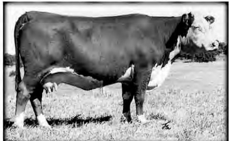
OXH CHRISTI 8185 • Powerful brood cow • CL1 Domino 5131E x High Volt 80S "Dam of Distinction" • 6 clvs./WR 107 ...three dgtrs. in our herd • Gdam, Lots 4, 42, 94 BW 3.3 WW 40 YW 67 MILK 25 M&G 44