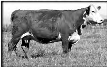
H5 MS 8020 DOMET 731 • "Dam of Distinction" workin' cow • OXH Mark Domino 8020 x HH Advance 9012Y • 8 clvs./WR 105 ...five replacement dgtrs. • Dam, Lot 83; Gdam, Lot 55 BW 3.6 WW 42 YW 55 MILK 22 M&G 43