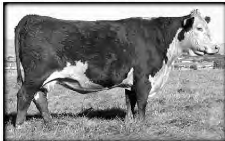
H5 MS 767 ADVANCE 047 • Big record cow • HH Advance 767 x OXH Mark Domino "Dam of Distinction" • 5 clvs./WR 107 ...one standout dght. • Dam, Lot 68