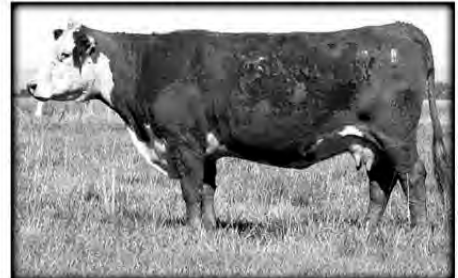
H5 MS 9012 DOMET 710 • Herd builder • HH Advance 9012Y x CA Domino 310 • 8 clvs./WR 102 ...four dgtrs., LMS Herefords herd bull • Granddam, Lot 17 and Lot 80 BW 1.2 WW 37 YW 50 MILK 21 M&G 39