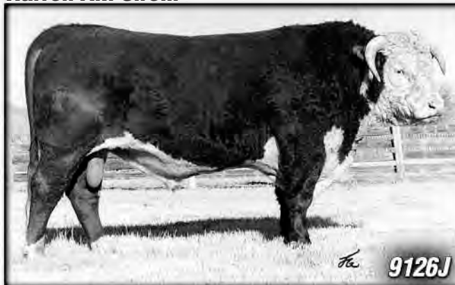
CL 1 DOMINO 9126J 1ET Jan. 31, 1999 • #41113279