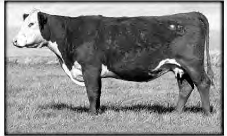
H5 MS 9012 DOMET 958 • "Dam of Distinction" herd builder • HH Advance 9012Y x OXH Mark Domino 8020 ..."Dam of Distinction" cow line • 7 clvs./WR 107 ...six top daughters!