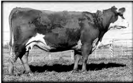
OXH TONI 0130 • Landmark "Dam of Distinction" ...former Oxley donor • OXH Andrew 8111 x SR Mark I J215 • 12 clvs./WR 111 • Producer of herd bulls, great dghts. • Gdam, Lot 1