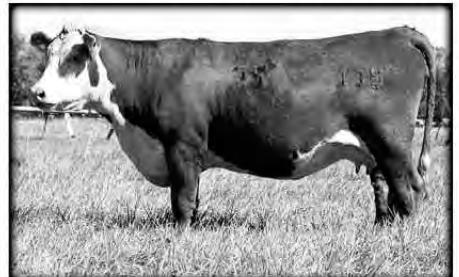
H5 MS 7159 DOMET 135 • "Dam of Distinction" milk cow • CL1 Domino 7159G x #915 cow (CL1 Domino 559E) • 5 clvs./WR 105 ...two dghts. • Dam, Lot 98; Gdam, Lot 24