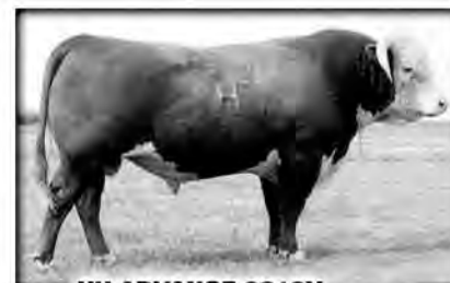
HH ADVANCE 9012Y 2/20/1989 (1775 progeny • 705 dgters.)

Complete Beef Bull ...Carcass REA Leader!