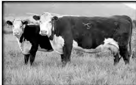
H5 MS 7038 DOM 9121 • HH Advance 7038G dgtr. ...CL1 Domino 8035 (CL1 590) dam • 7 clvs./WR 104 • Gdam, Lot 66 BW 5.4 WW 38 YW 65 MILK 17 M&G 35