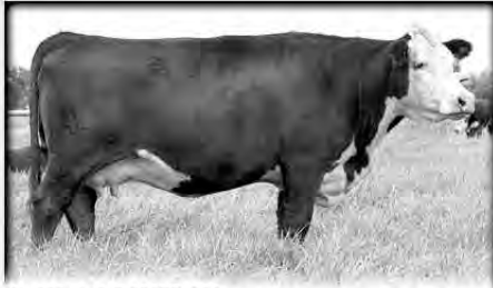
H5 MS 559 DOMET 938 • Elite brood cow • CL1 Domino 559E x CA Domino 338 (386), HH Advance 9012Y • 7 clvs./WR 107 ...three replacement dghts. • Dam, Lot 69; Gdam, Lots 56, 73 and 74