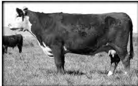
H5 MS 7159 DOMET 132 • Powerful "Dam of Distinction!" • OXH Mark Domino 8020 x 9012Y • 7 clvs./WR 111 ...six standout daughters!