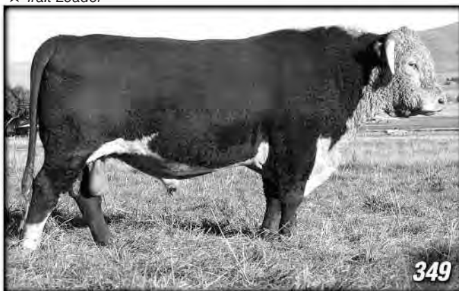
H5 767 ADVANCE 349 Feb. 3, 2003 • #42367704