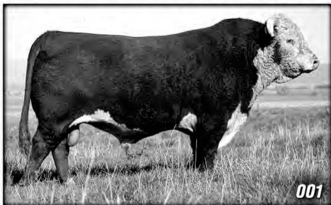
H5 501 DOMINO 001 Jan. 20, 2000 • #42054176