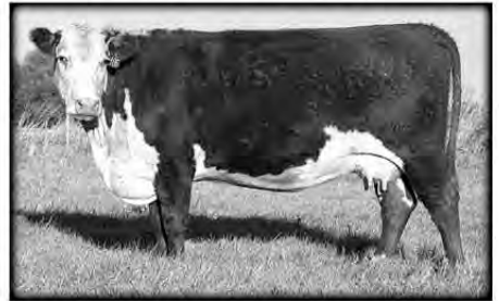
H5 MS 767 ADVANCE 106 • Beautiful cow ...HH Advance 767G x HH Advance 7038G • 4 clvs./WR 101 ...three replacement daughters • Dam, Lot 66