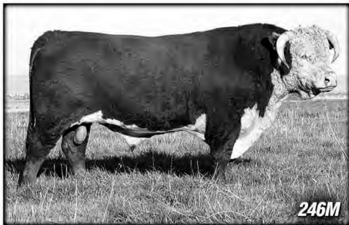
CL 1 DOMINO 246M Jan. 10, 2002 • #42270337

Cowherd to Carcass ...A Beef Industry Sire!