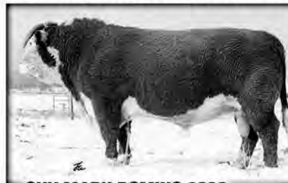
OXH MARK DOMINO 8020 3/18/1988 (2067 progeny • 778 dgters.)

Foundation Curve Bender, Cowherd Builder!