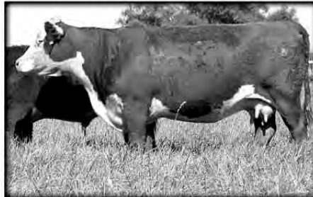
H5 MS 9012 DOMET 767 • Role model matron ...functional, problem-free producer • HH Advance 9012Y x CL1 Domino 1024 • 9 clvs./WR 102 BW 1.8 WW 31 YW 44 MILK 25 M&G 40