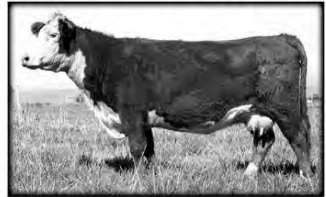
H5 MS 500 DOMET 8182 • Herd bull cow • CL1 Domino 500E x LS Young Donald 45K "Dam of Distinction" mother • 8 clvs./WR 108 ...six dgtrs. • Dam, H5 sire H5 501 Domino 001 BW 3.3 WW 38 YW 59 MILK 25 M&G 44