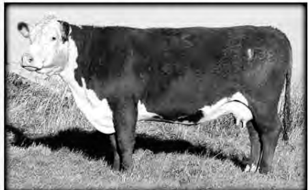
H5 MS 559E ADVAN 838 • Herd building "Dam of Distinction" • CL1 Domino 559E x HH Advance 9012Y Dam of Dist. mother • 8 clvs./WR 109 ...four top dgtrs. • Dam, Lot 54 BW 2.5 WW 40 YW 69 MILK 25 M&G 45