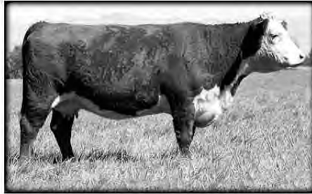
H5 MS 9012 DOMET 959 • HH Advance 9012Y dght. ...dam, 783 (CA Domino 398 x 114 Domino) "Dam of Distinction" • 4 clvs./WR 110 ...top replacement dghts.