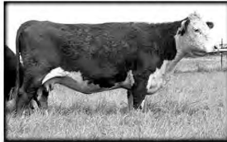
H5 MS 398 DOMET 783 • "Dam of Distinction" power cow • CA Domino 398 x 114 Domino • 9 clvs./WR 108 ...three dgtrs. • Dam, Harrell sire H5 767 Advance 274 BW 6.0 WW 43 YW 60 MILK 23 M&G 45