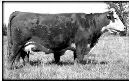
H5 MS 8020 DOMET 734 • Powerful "Dam of Distinction!" • OXH Mark Domino 8020 x HH Advance 9012Y • 9 clvs./WR 111 ...six top daughters! • Gdam, Lot 25 and Heifer Lot 112 BW 4.7 WW 48 YW 71 MILK 25 M&G 49

An American Hereford Top 10 "Dams of Distinction" Herd ...#1 in Oregon!