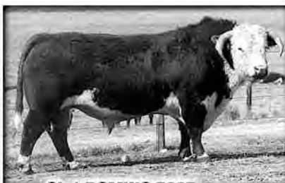
CL 1 DOMINO 500E 1/16/1995 (345 progeny • 120 dgters.)

Landmark Maternal / Carcass Sire ...Few Compare!