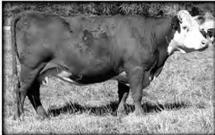
H5 MS 559 DOMET 915 • CL1 Domino 559E (CL1 166) x CA Domino 338 (CL1 386) • 6 clvs./WR 107 ...four herd replacements • Dam, Lot 39; Gdam, Lots 24, 98